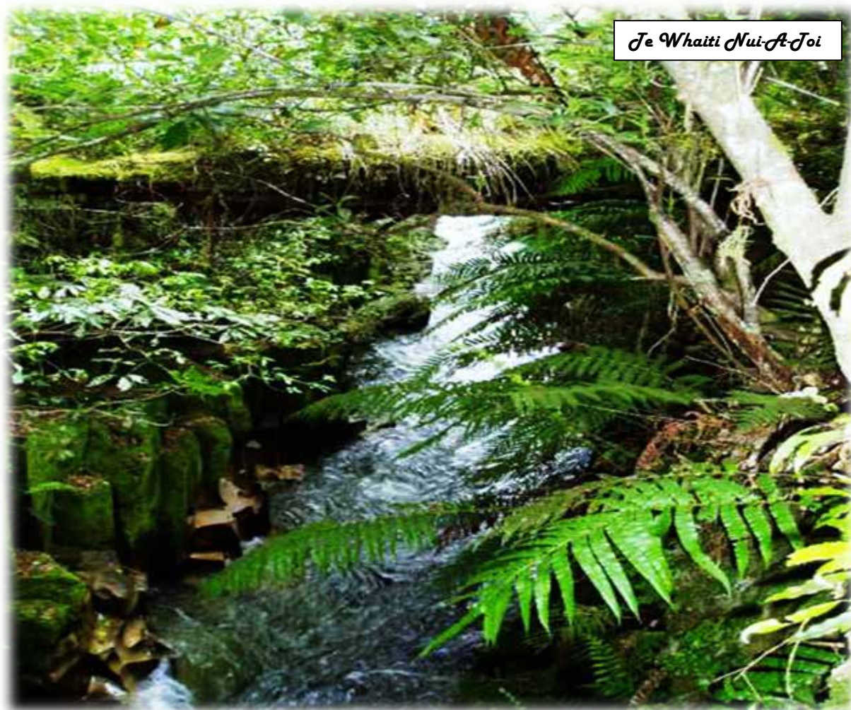
Te Whaiti Nui-A-Joi

Pou Whakahaere, Te Runanga o Ngati Whare